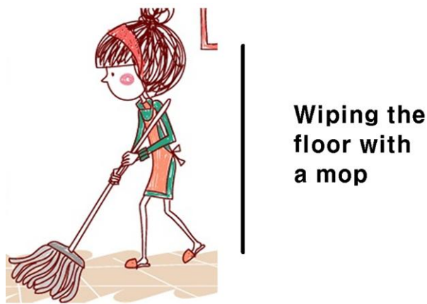
Figure 1. An example of pre-test

The pre-test was administered before the training session on the first day. The test consisted of six verb and six picture questions. In the verb questions, an experimenter showed four selections (pictures) for one verb related to house cleaning knowledge and skills. The student was asked to select the one whose picture matched the verb question. In the picture questions, an experimenter showed four selections (sentences) for one picture related to house cleaning knowledge and skills (e.g. Figure 1). Then, the student indicated selected the sentence that matched the question. Using the same rules, six verbs and six pictures were presented. Each question was worth 1 point.